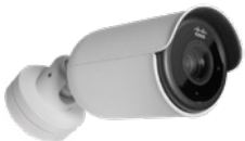
Ultra-long-range telephoto bullet MV52

An ultra-long-range 4K camera for challenging environments where distance and detail matter. Ideal for a parking lot or perimeter monitoring, license plate capture or subject identification.