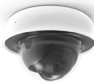
Narrow angle MV12N

Best for hallways and corridors and useful for subject identification, with a 73-degree horizontal field of view.