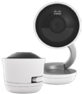
Flexible and adjustable MV2

Brings together physical security and advanced analytics in a flexible, compact camera with a 103-degree field of view.