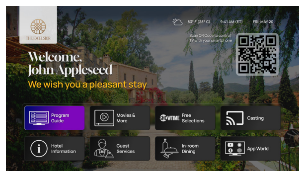
Premium and Basic welcome screen

Differentiate your property with an in-room technology platform that meets guest desires for contactless interactions and personalized experiences.